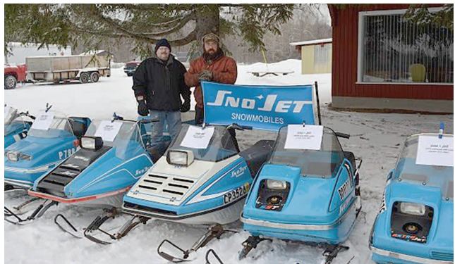
Vintage snowmobiles will be on display on Saturday at the East Jordan Sno-Mobilers Club House, located on Mt. Bliss Rd.