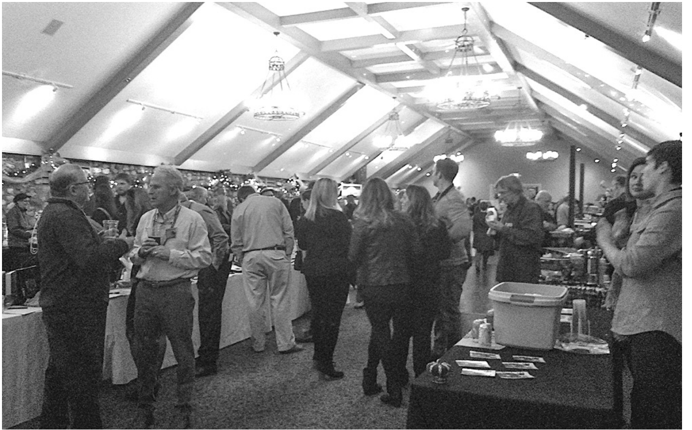
Char-Em United Way's sixth annual Toast to Literacy fundraising event will take place at Castle Farms in Charlevoix on Saturday, February 23, from 7 to 10pm.