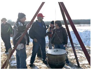
Don't miss the Bean Pot at the East Jordan Sno-Mobilers Club.

Families will enjoy the Grand Story Hour at Books N' Things and a Family