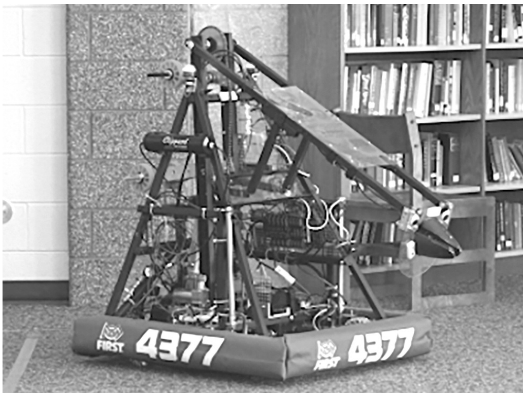
Boyer City Blaze Robotics team is proud to present their robot for the 2019 FRC Robotics competition.

The challenge presented by FRC's game, DESTINATION: DEEP SPACE, requires teams to create a robot to do the following: navigate through a "sand storm" with vision track-