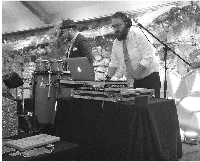
At the event, attendees can look forward to enjoying an evening of wine and beer tastings, a catering competition, photo booth, silent auction, and entertainment.

Tickets are $50 in advance or $55 at the door. For tickets, to register or for additional information, call 231-487-1006 or go to http://www.charemunited-way.org/toast