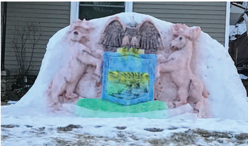
Beautiful snow sculptures around town are a tradition at the East Jordan Sno-Blast.

Movie, Christopher Robin, at the East Jordan Civic Center on Saturday. At new event at Sno-Blast this year is the TNT "Ride Like a Girl to Save the Girls Bikini Radar Run" also taking place on Saturday.