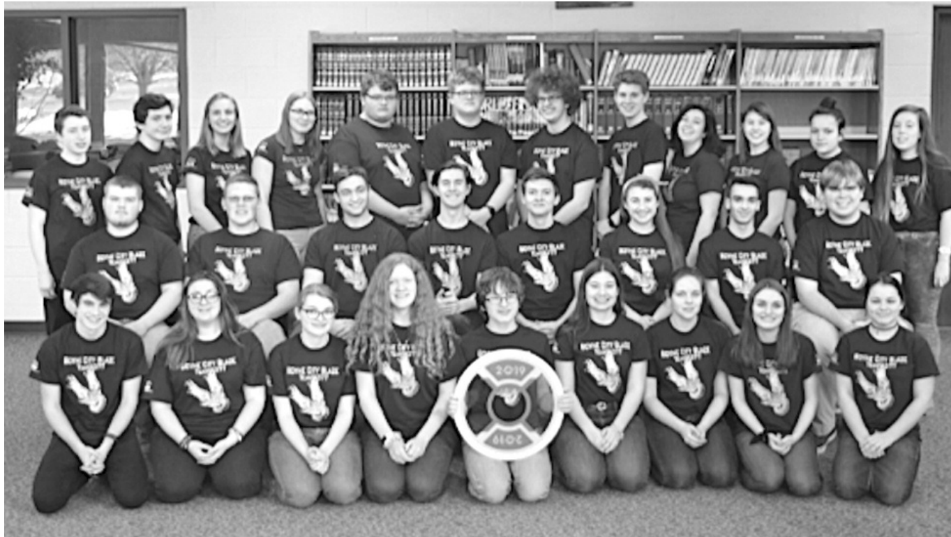
B.C. Blaze has grown into a team of 38 High School Students and three Middle School Students.